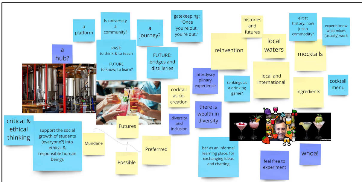
See bigger pic. as an Appendix 4.

Aware of the less healthy implications of alcohol and its potentially dangerous effects, the positive aspects of cocktails became a metaphor for the group through which to envisage a process of designing them ( process ) and delivering them ( product ) toward a university experience that was integrated within wider social, cultural and economic ecosystems.