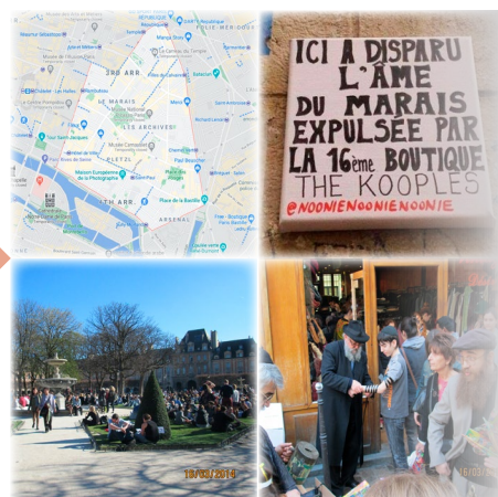
Le Marais, Paris